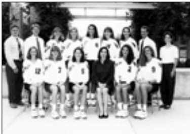
1996 BIG EAST Champions NCAA Round of 16