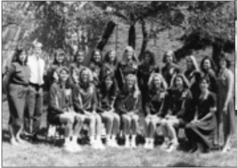
1992 MCC Champions NCAA Round of 32