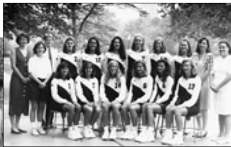
1993 MCC Champions NCAA Quarterfinals