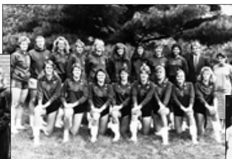
1987 North Star Champions