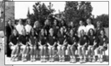
1998 BIG EAST Champions NCAA Round of 32