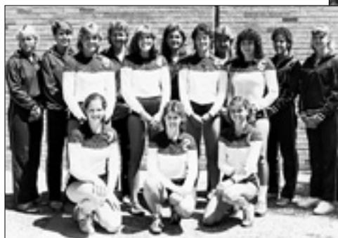
1986 North Star Champions