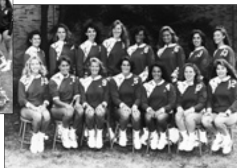
1991 NIVC Runner-Up