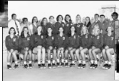
1997 BIG EAST Champions NCAA Round of 16