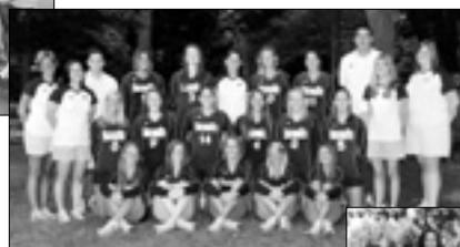
2005 BIG EAST Runner-Up NCAA Round of 64