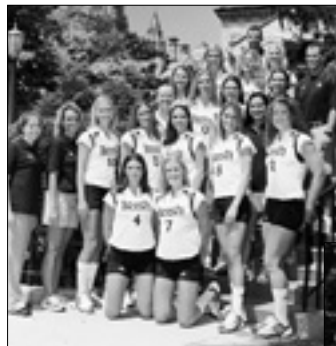
2004 BIG EAST Runner-Up NCAA Round of 64