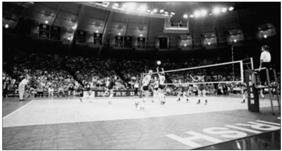
A record crowd of 8,643 witnessed the Irish outlast former league rival Virginia Tech in a five-game marathon on Nov. 7, 2003.

On 15 occasions, Notre Dame has topped ranked teams in the Joyce Center, including five wins over top-10 opponents. In 1993, the Irish downed national power Nebraska twice at home, first defeating the