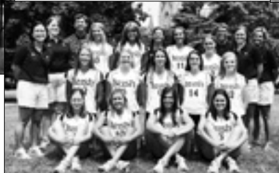
2006 BIG EAST Champions NCAA Round of 16