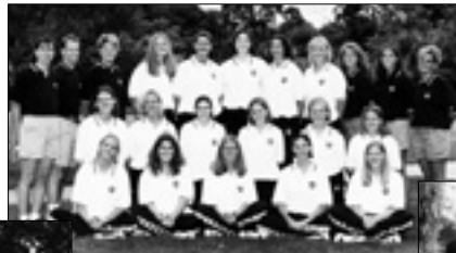
1999 NCAA Round of 64