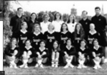
2001 BIG EAST Champions NCAA Round of 64