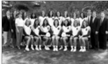
1995 BIG EAST Champions NCAA Round of 32