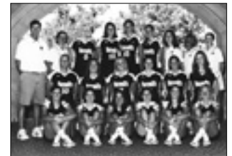
2002 BIG EAST Champions NCAA Round of 32