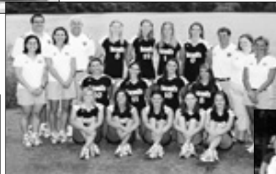
2003 BIG EAST Runner-Up NCAA Round of 32