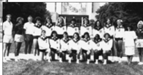
1988 NCAA Round of 16