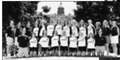
2000 BIG EAST Champions NCAA Round of 32