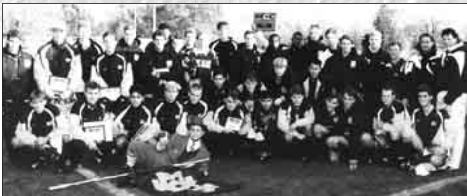
Notre Dame captured its second consecutive Midwestern Collegiate Conference tournament crown in 1994 with a 3-2 overtime win against Wisconsin-Milwaukee.

During Notre Dame's seven years as a member of the Midwestern Collegiate Conference, the Irish compiled a 24-13-4 record (.634) in regular-season competition and were 13-4 (.765) in seven tournament appearances. Notre Dame captured the tournament championship in 1988, won back-to-back titles in 1993 and 1994, and advanced to the semifinals of the MCC tournament all but one season (1990).