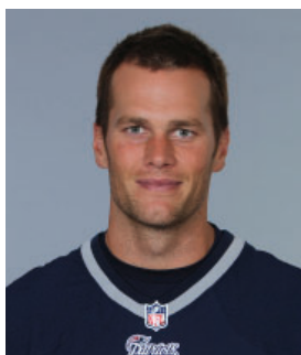
TOM BRADY, QB New England Patriots 20th Season