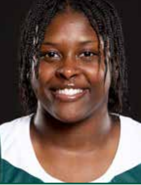
2019-20 Superlatives and Honors

Played in 98 games as a Spartan, starting 15 ... Scored 346 points during her career, averaging 3.6 ppg.