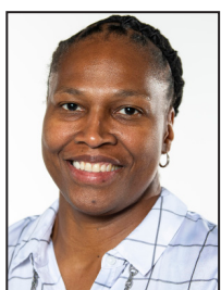
ASSISTANT COACH YOLANDA GRIFFITH 2nd Season