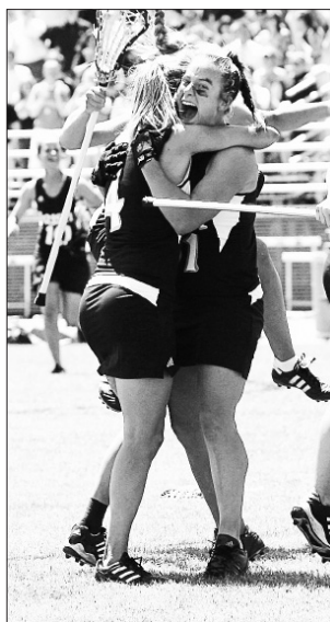
Notre Dame's first-ever win against Georgetown on May 20, 2006 sent the Irish to the 2006 NCAA Finals in Boston, Mass.