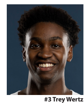
Gr. // G // 6-5 Charlotte, NC Providence Day/Santa Clara