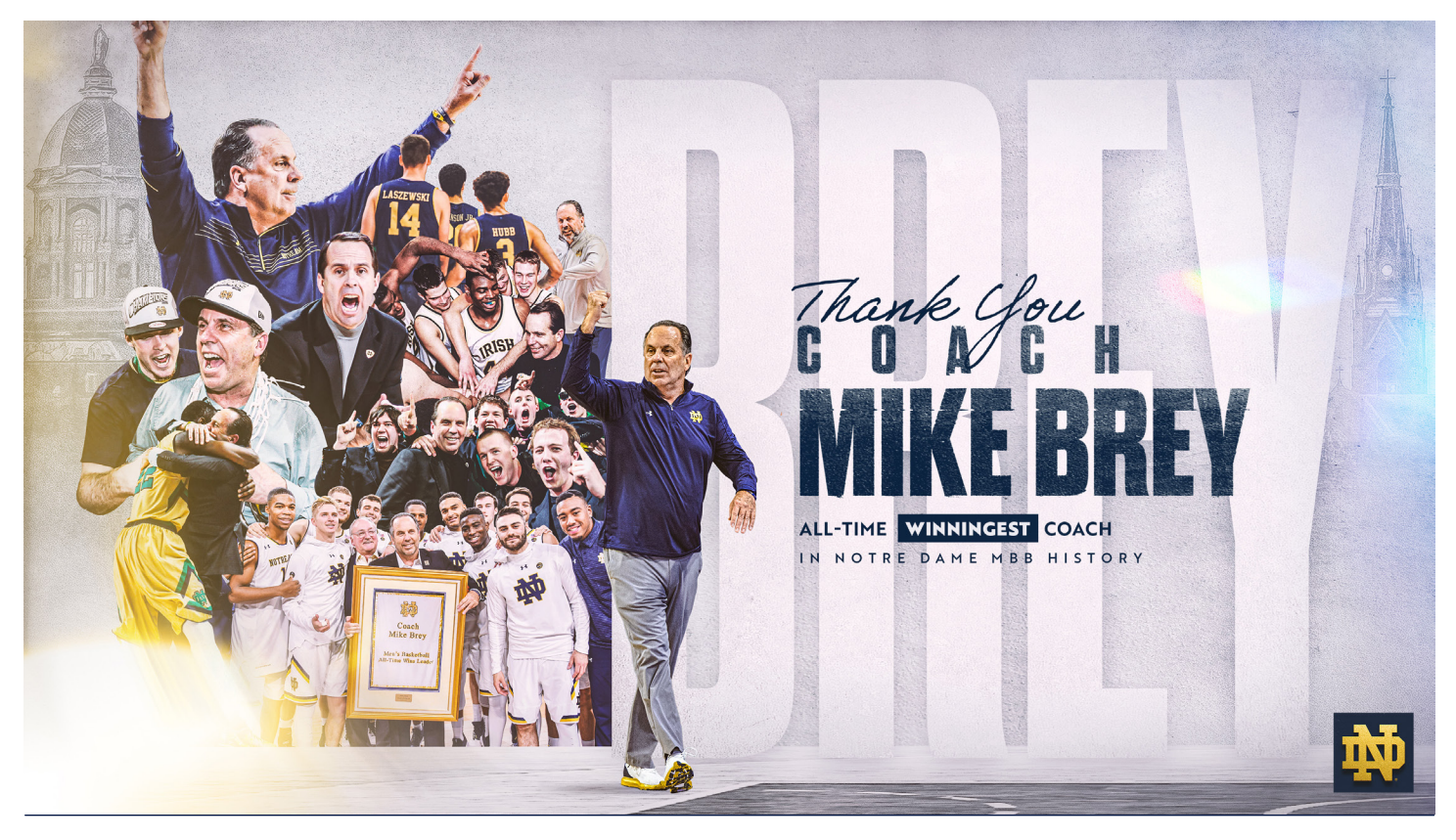
2022-23 NOTRE DAME BASKETBALL NOTES