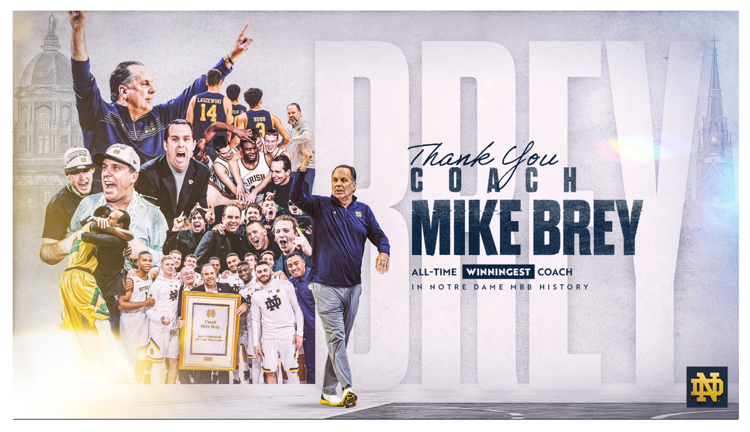
2022-23 NOTRE DAME BASKETBALL NOTES