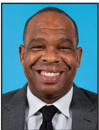
HUBERT DAVIS Head Coach