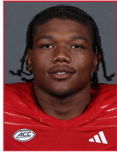
WR • 6-0 • 190 • R-So. Tennessee Morrow, Ga.