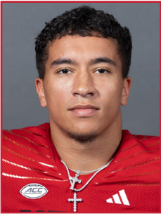
DB • 6-2 • 210 • R-Sr. North Carolina Chesapeake, Va.