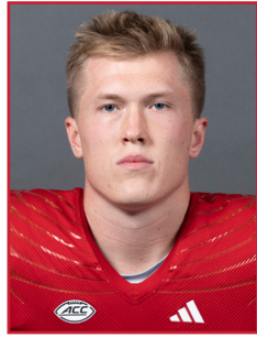
TE • 6-3 • 235 • So. Gonzaga Washington, D.C.