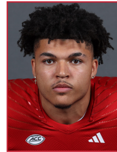
RB • 6-1 • 225 • Sr. Wisconsin Clayton, Ind.