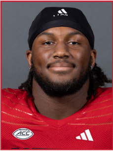
DL • 6-3 • 270 • R-Jr. Eastern Louisville, Ky.