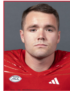
K • 6-1 • 205 • Jr. North Paulding Acworth, Ga.