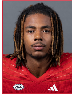
DB • 6-3 • 205 • R-So. Hillcrest Chicago, Ill.