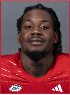
DB • 6-0 • 190 • Jr. Florida State Miami Gardens, Fla.