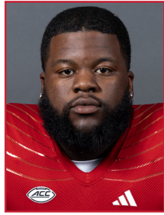
DL • 6-1 • 290 • Jr. Dutchtown Stockbridge, Ga.