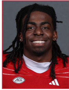
DB • 5-10 • 185 • R-Jr. Iowa Western CC Warner Robins, Ga.