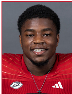
RB • 5-10 • 190 • So. Coffee Nicholls, Ga.