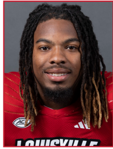
LB • 6-1 • 230 • R-So. Lowndes Valdosta, Ga.