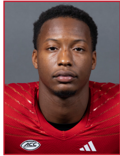
WR • 6-1 • 185 • R-Jr. Georgia State LaGrange, Ga.