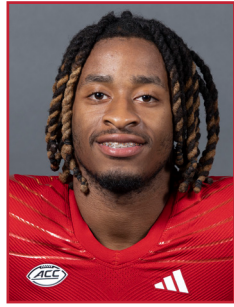
WR • 5-11 • 180 • So. Jackson State St. Louis, Mo.