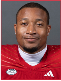
DB • 6-0 • 210 • Jr. Baylor Lexington, Ky.