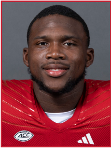
LB • 6-3 • 230 • Fr. Miami Central Miami, Fla.