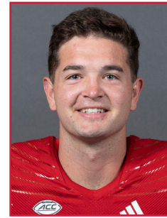
QB • 6-2 • 225 • Sr. Independence CC Colorado Springs, Colo.