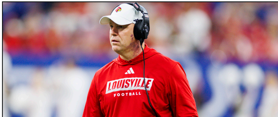
HEAD COACH JEFF BROHM FIRST SEASON • 71-44 OVERALL • 5-0 LOUISVILLE

Jeff Brohm, one of the most accomplished signal callers in school history, returns to his alma mater to lead the University of Louisville football program.