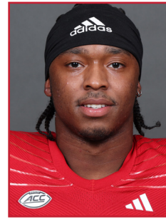
RB • 5-10 • 185 • R-Jr. Syracuse Long Island, N.Y.