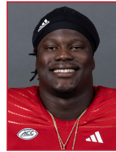
DB/LB • 6-1 • 220 • R-Sr. Miami Coconut Grove, Fla.