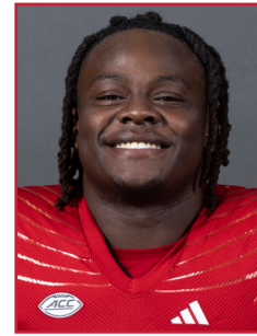
DL • 6-0 • 290 • R-Jr. Georgia State Powder Springs, Ga.