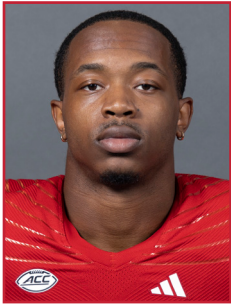
DB • 6-1 • 200 • R-Sr. North Carolina Boiling Springs, N.C.