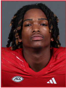
WR • 6-2 • 190 • Jr. Cincinnati Chicago, Ill.