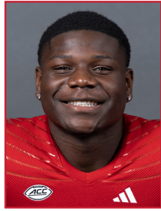
WR • 6-2 • 225 • So. Greenville Christian Yazoo City, Miss.