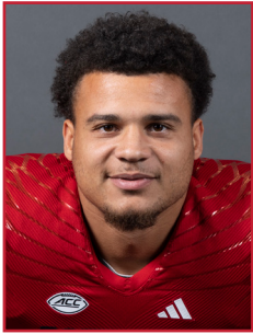
TE • 6-4 • 245 • R-Sr. UCF Jacksonville, Fla.