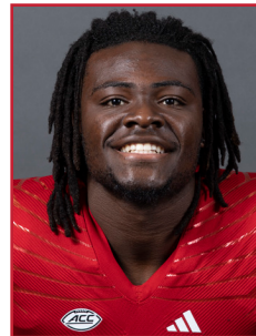
DL • 6-3 • 250 • So. Westfield Westfield, Ind.