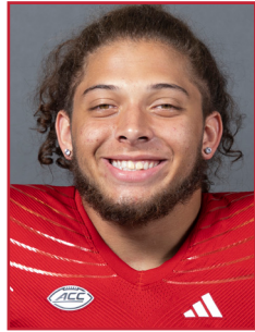
DL • 6-3 • 270 • Jr. Boca Raton Boca Raton, Fla.