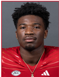
LB • 6-2 • 225 • So. Carver Columbus, Ga.