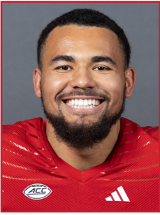
DL • 6-4 • 240 • R-Sr. Stanford Louisville, Ky.