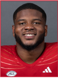
LB • 6-1 • 230 • Jr. Valdosta Valdosta, Ga.