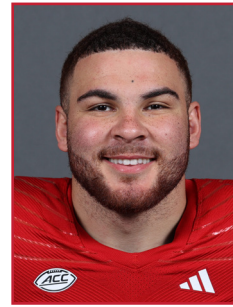
LB • 6-2 • 235 • Jr. Oregon Lebanon, Ore.