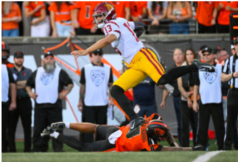
QB Caleb Williams