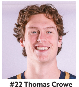
Jr. // F // 6-7 Macedonia, OH Archbishop Hoban