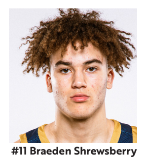
Fr. // G // 6-3 State College, PA State College Area