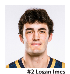
Fr. // G // 6-4 Zionsville, IN Zionsville