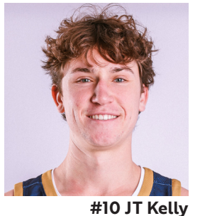
So. // G // 6-2 Ponte Vedra Beach, FL Ponte Vedra