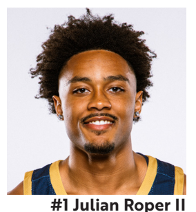
Jr. // G // 6-4 Detroit, MI St. Mary's / Northwestern