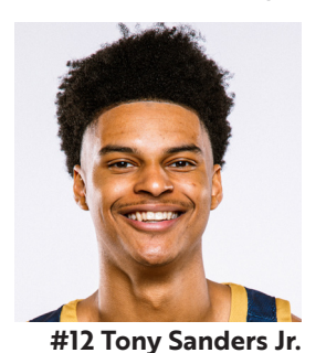
Sr. // G // 6-7 Miami, FL Gulliver Prep