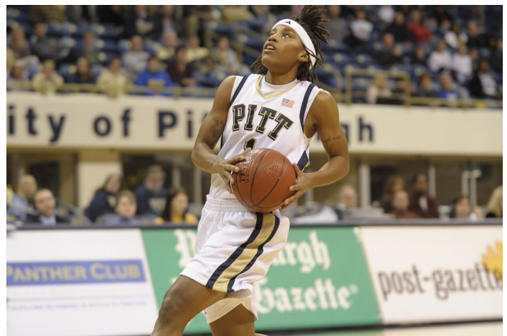
Pitt great Shavonte Zellous is the last Pitt player to score 40 points in a game as she netted 42 in a win over Florida on Dec. 21, 2008.