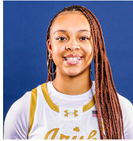
#3 Hannah Hidalgo Fr. // G // 5-6