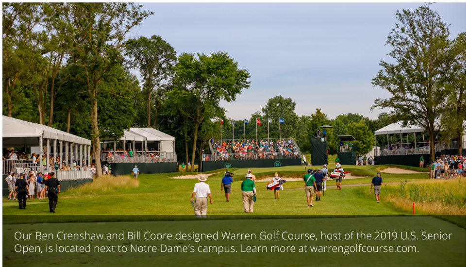
Our Ben Crenshaw and Bill Coore designed Warren Golf Course, host of the 2019 U.S. Senior Open, is located next to Notre Dame's campus. Learn more at warrengolfcourse.com .