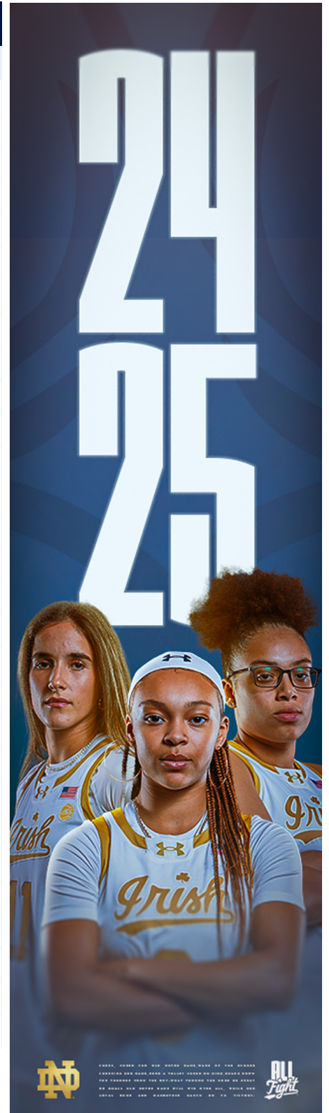
*Notre Dame is listed first in each column*