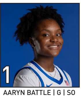
Sewell, NJ Camden Catholic