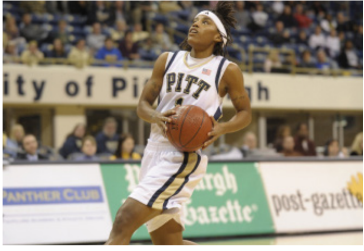
Pitt great Shavonte Zellous is the last Pitt player to score 40 points in a game as she netted 42 in a win over Florida on Dec. 21, 2008.