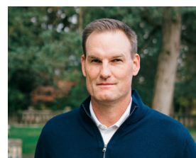
Pat Garrity General Manager 1st Season at ND