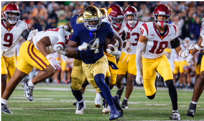
RB Jeremiah Love had a career-high 228 rushing yards on 24 carries to average 9.5 yards per carry.